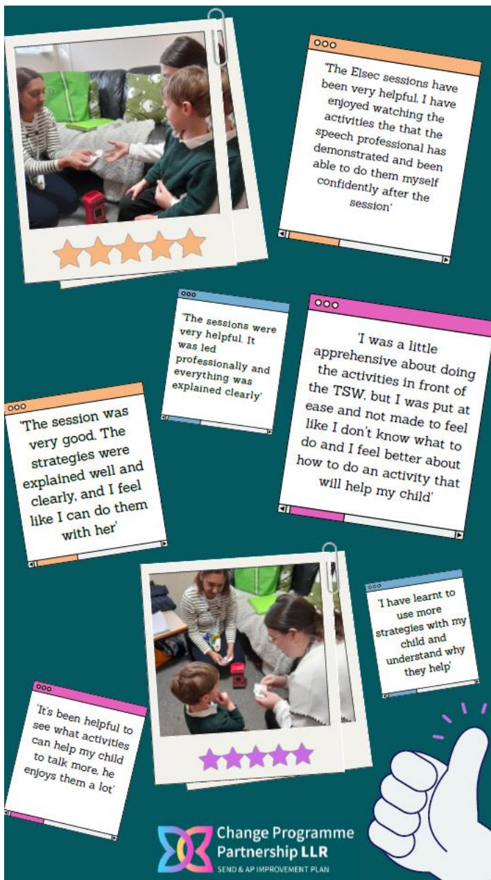
Figure 4: Summary of ELSEC feedback from families